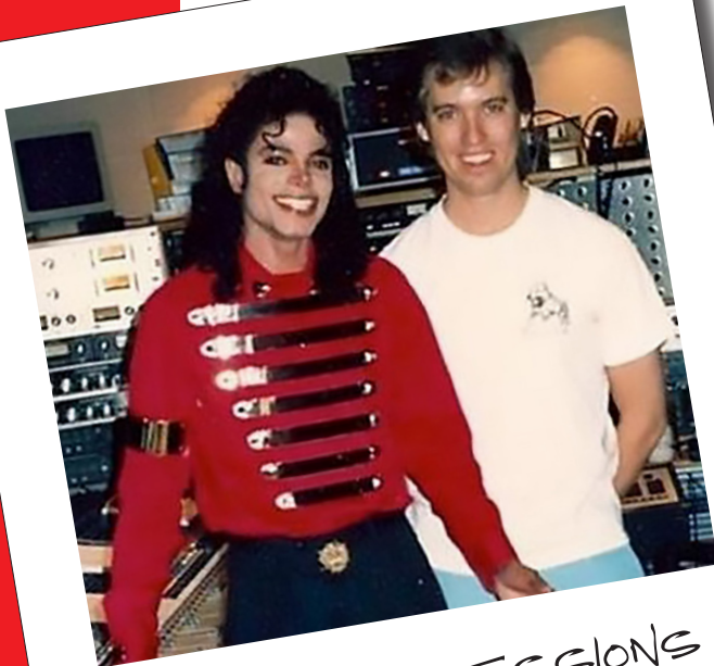
DANGEROUS SESSIONS 91