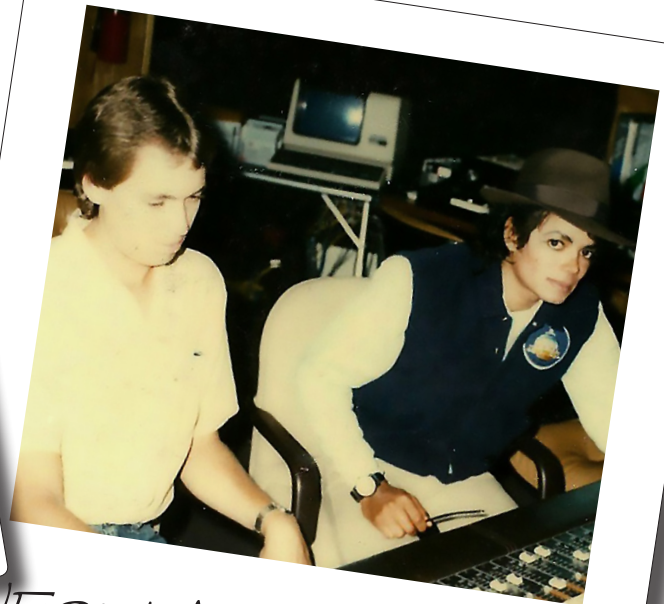
WESTLAKE STUDIOS 87